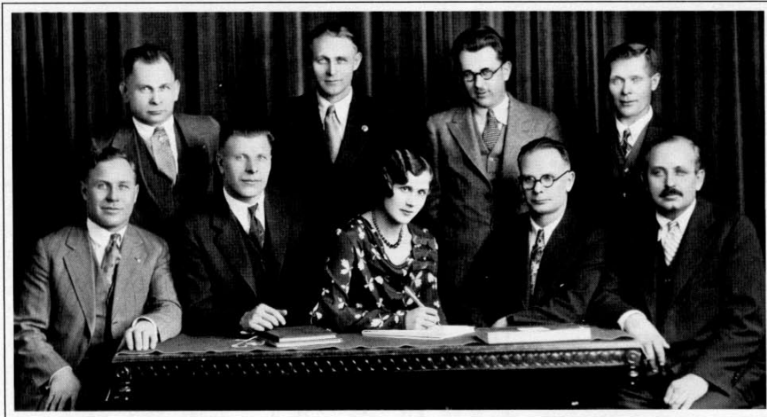
PICTURED IS THE FIRST BOARD OF DIRECTORS OF THE CO-OP CREDIT UNION, ELECTED IN 1930.

Continuity has been even more impressive for management leadership. Consumers Credit Union has had only five Presidents/CEO in our first century, each averaging nearly 19 years at the helm. The transition from one leader to the next has always been very smooth, each change carefully planned for and implemented, without disruption and without negative impact on members and/or staff.