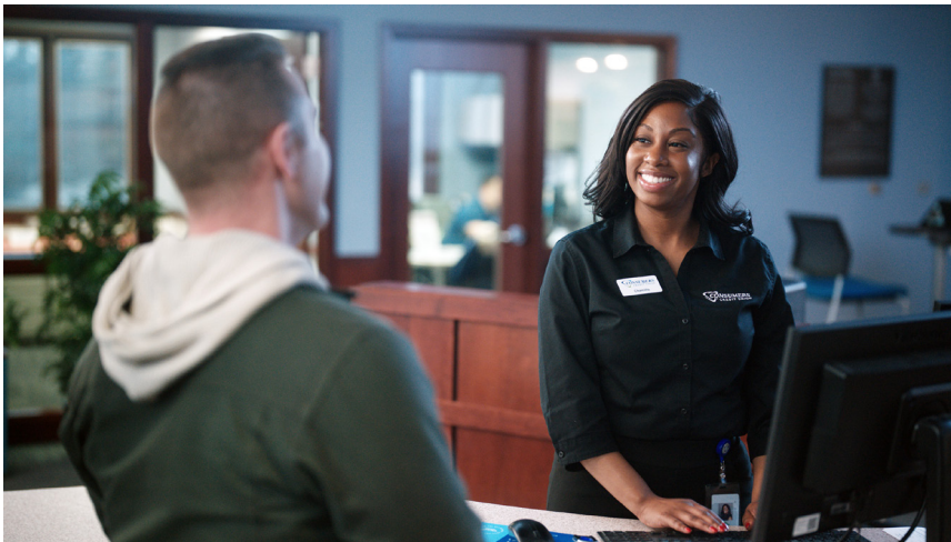
A WOMAN-LED GROUP CREATED THE COOPERATIVE THAT BECAME CCU'S INITIAL SPONSOR.

Diversity and inclusion are also important components of Consumers Credit Union's management and staff. With 15 branch locations, the credit union serves a wide variety of neighborhoods, where there are many different ethnic and racial groups. We continuously strive to staff each location with employees who represent those communities, because that positions our front-line staff to better understand – and serve – each member's individual needs.