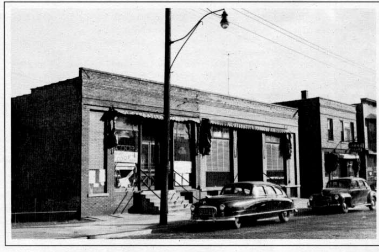
CCU'S FIRST OFFICE ON MCALISTER AVENUE, WAUKEGAN

The credit union had only one location in our first half-century — McAlister Street in Waukegan, IL. Recognizing the need to strengthen our physical presence, we built our first standalone office on Washington Street in the 1960s. The office was a big hit and with membership growing quickly, CCU replaced it in 1975 with a sparkling new Waukegan facility at 2750 Washington Street. This location went on to serve as the credit union's headquarters until the early 2000s.