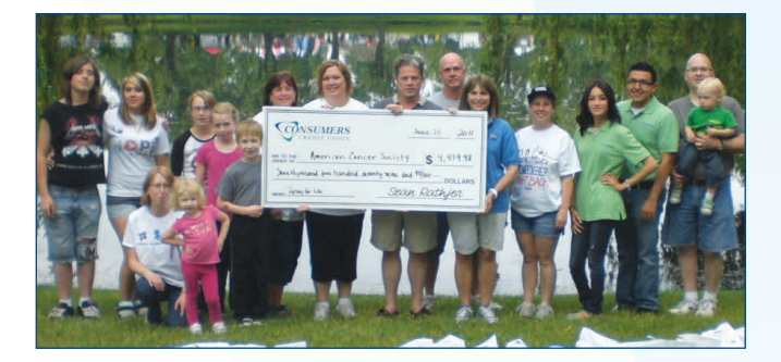
CCU employees, friends and family presenting a donation of $4,479.98 to the American Cancer Society's Relay for Life.