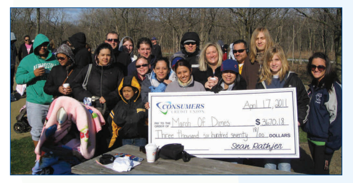
CCU employees, friends and family presenting a donation of $3,670.18 to the March of Dimes Foundation.